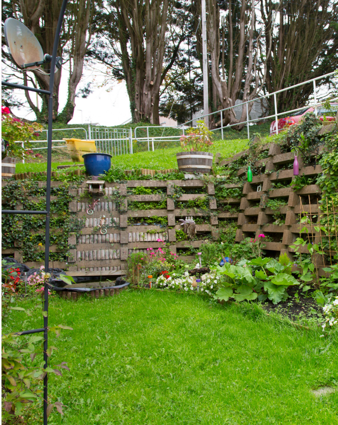
* Please note that all images are for illustrative purposes only.